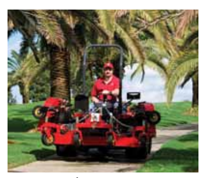
Raises for transport up to 18" (457mm) from ground

317.892.4444 1.800.515.6798 Fax: 317.892.4188